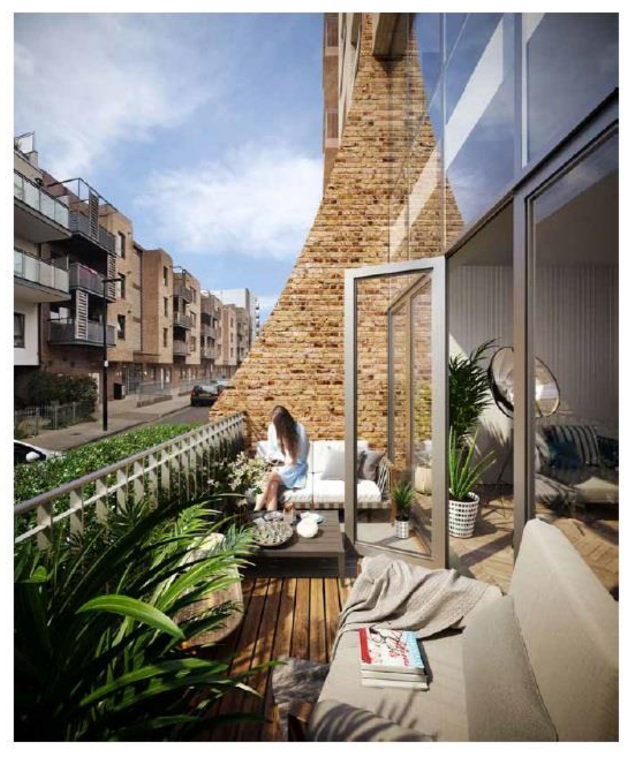
CGI of private amenity space to west facing maisonettes on Leven Road